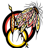
MATAWA FIRST NATIONS MANAGEMENT