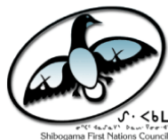
Shibogama First Nations Council